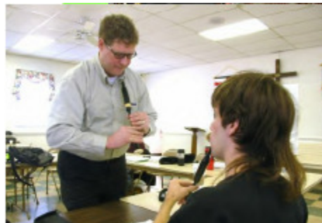
Passing on the knowledge

In addition to participating in the above events, we give back to the community that supports us. From playing school events to helping raise money for Special Olympics and people in need in the community, we do our best to help the community we belong to and pass on our love of playing.